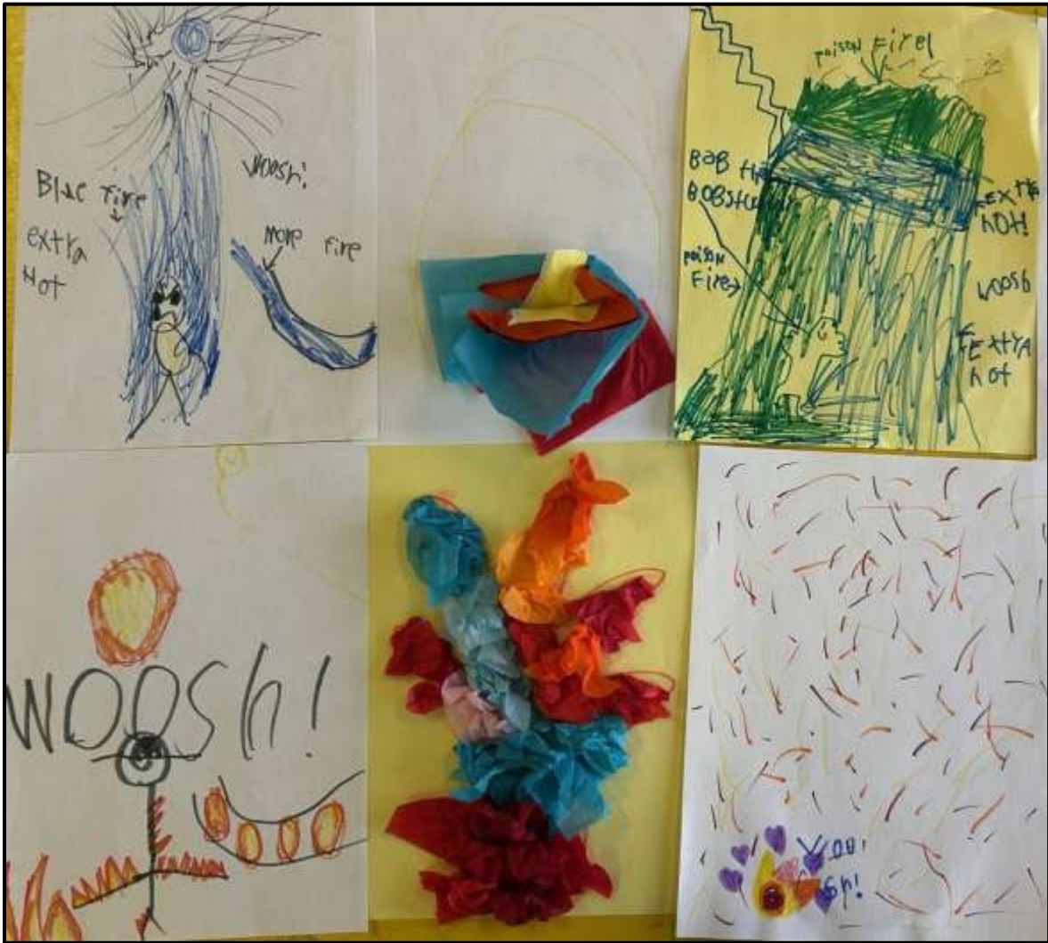
Artwork created by the Kindergarten-2nd Grade Faith Formation Class

FIRST PRESBYTERIAN CHURCH DURHAM, NORTH CAROLINA