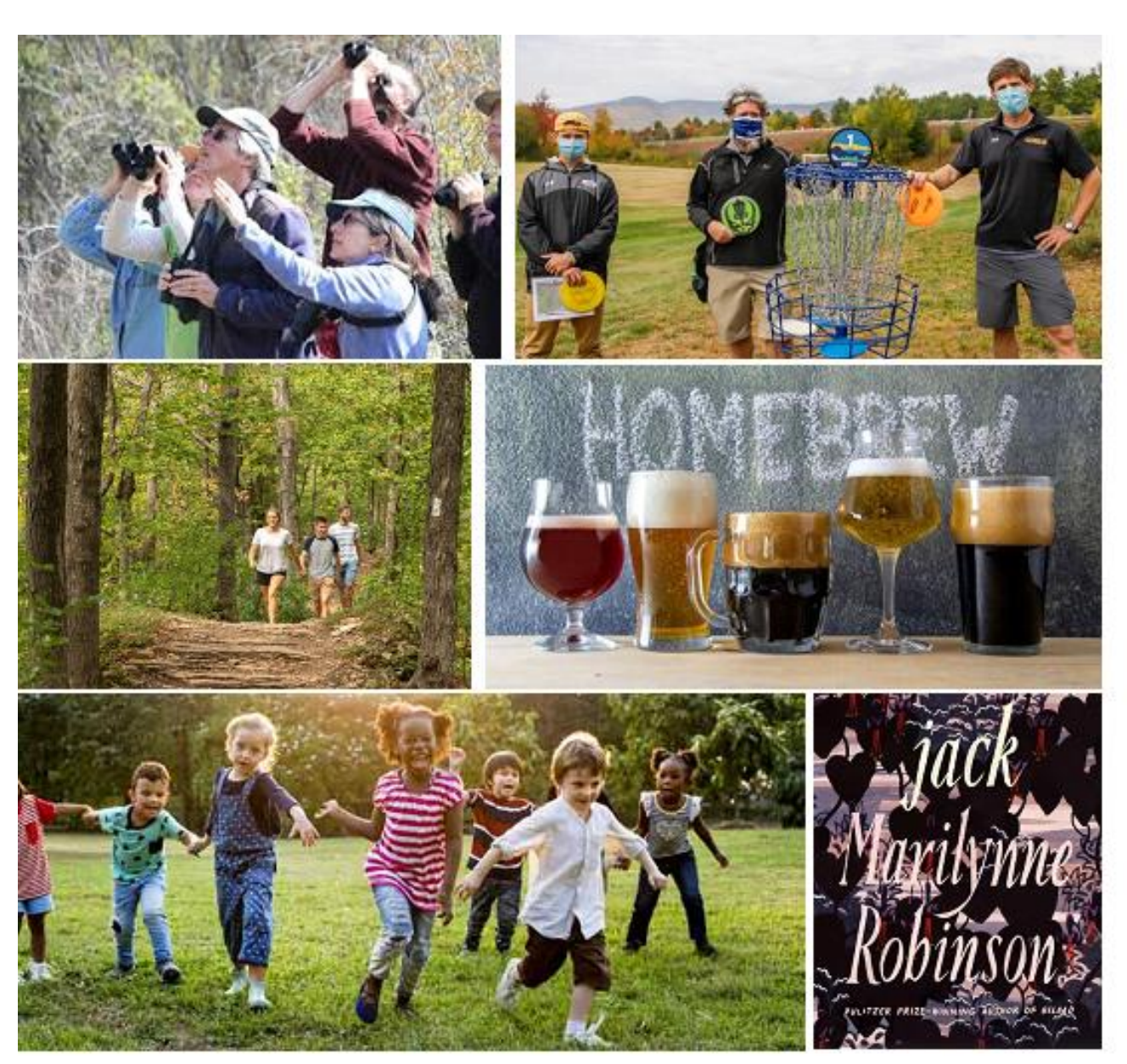
Spring Fellowship Opportunities

FPC is full of people with a rich variety of interests. From birding to book discussions, beer tasting, and backyard gardens. CLICK HERE to check out the variety of opportunities to meet someone new, indulge a curiosity, or connect with other enthusiasts. Please sign up for opportunities that best fit the interests of you and your household. Remaining activities are Birding (May 15), Disc Golf (May 15), and Book Discussion (June 6). We are continuing to limit the size of gatherings and ask that you mask and stay socially distant. Questions? Email <u>Mitzi</u>.