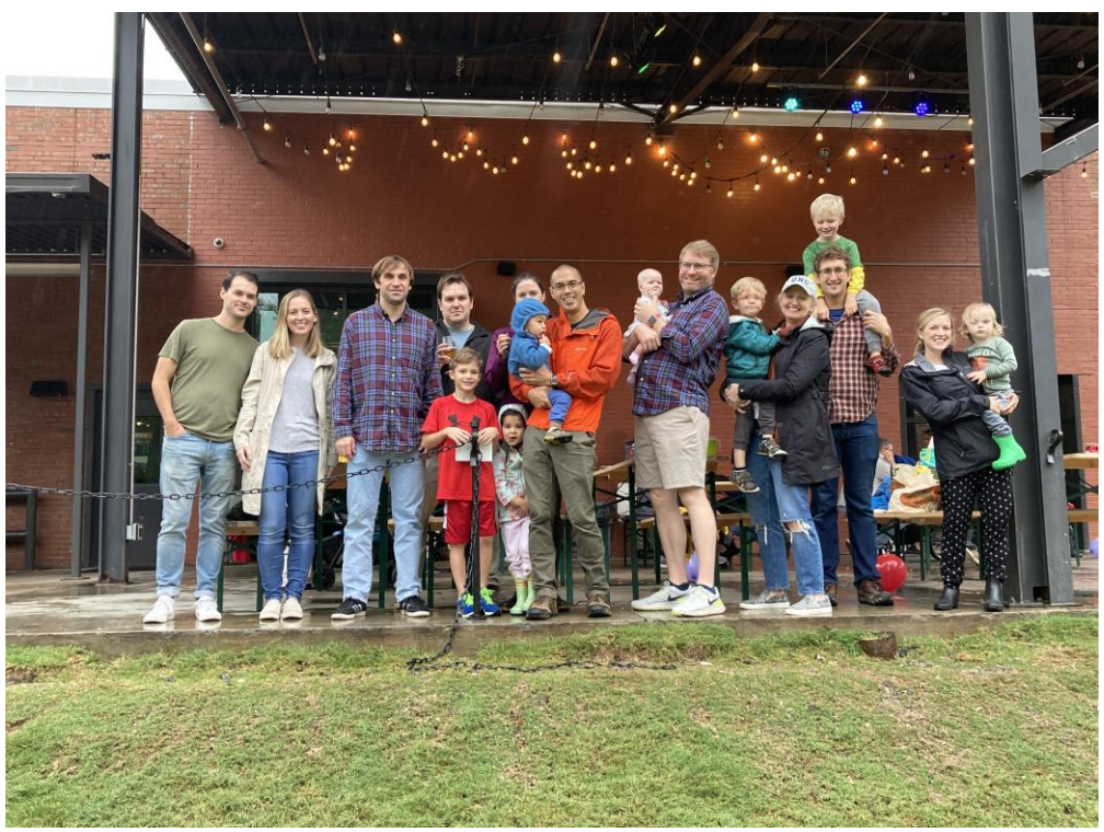
MnMs Class / Fellowship Group - October 2022