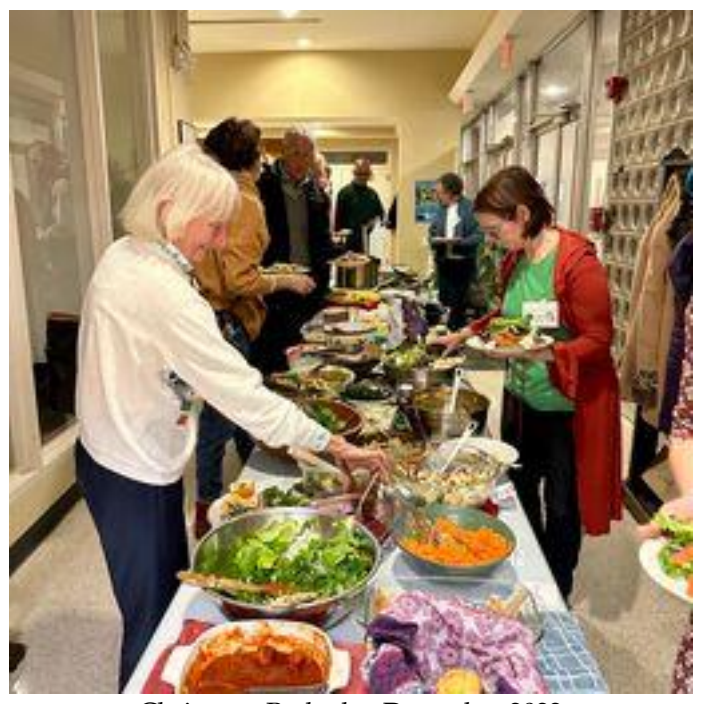
Christmas Potluck - December 2022