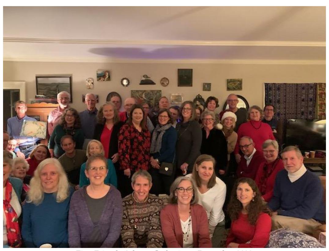
First Friends Advent Gathering – December 2022